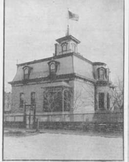
DR. KELLOGG'S SANTARUM.

Dr. Kellogg's Santarum. The building is located at the corner of Third and Broadway streets.